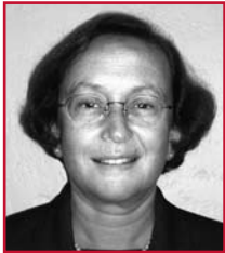
Hon. Judith Fabricant Massachusetts Superior Court