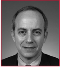
Hon. Mitchell Kaplan Massachusetts Superior Court